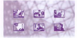
IT Governance Global Status Report—2008

ITGI's IT Governance round table documents can be downloaded free of charge at www.itgi.org . The survey on which this discussion is based – titled IT Governance Global Status Report 2008 – is also available as a free download at the ITGI website.